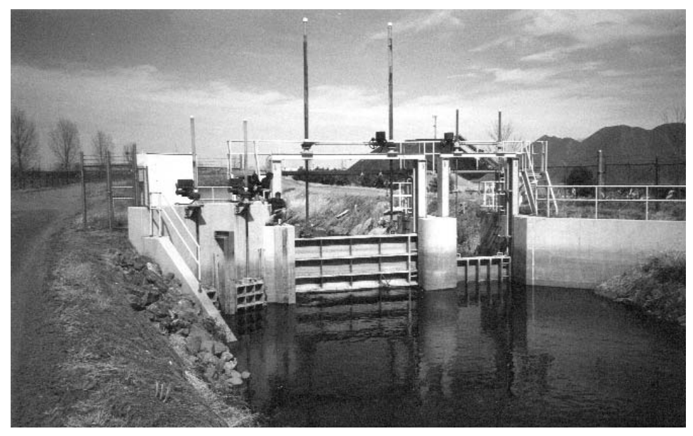
Tandem electrically actuated roller gates.